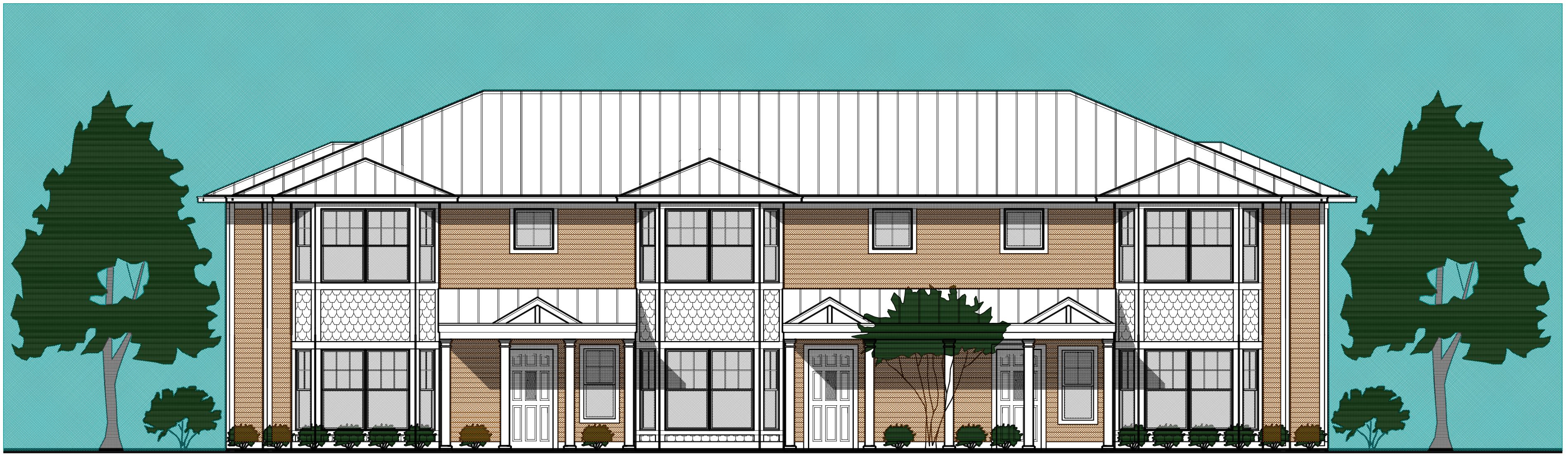
'TH3' 3-Unit Town Home Front Elevation