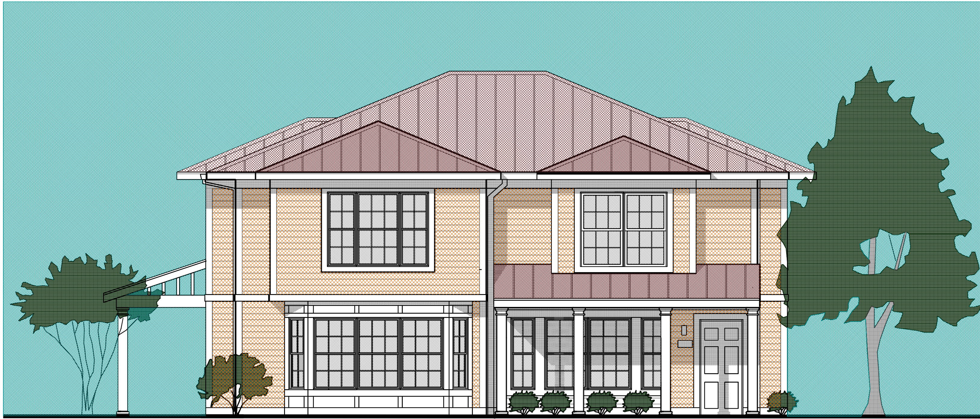
'D1' Duplex Front Elevation