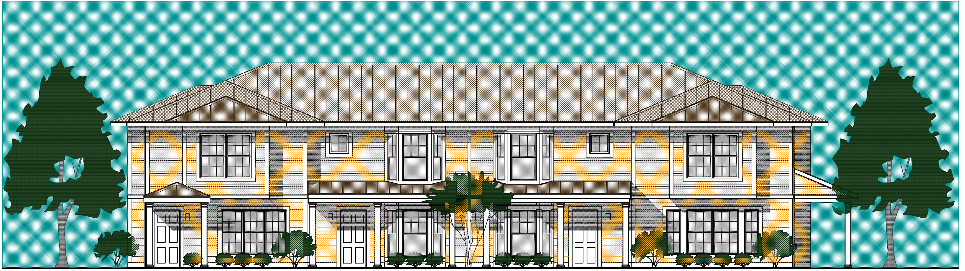
'TH4' 4-UNIT TOWN HOME Front Elevation